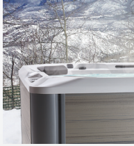
FiberCor® High-Density Insulation