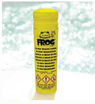
Frog® In-Line Sanitising System