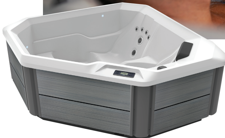
Shown with Alpine White Shell and Storm Cabinet.