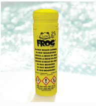
Frog® In-Line Sanitising System