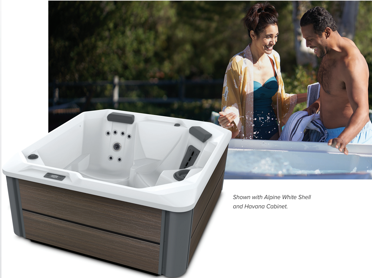
Shown with Alpine White Shell and Havana Cabinet.

People Seating Jets Voltage 3 Seats Open 18 Jets 240 V