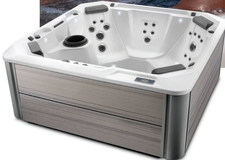
Shown with Alpine White Shell and Almond Cabinet.