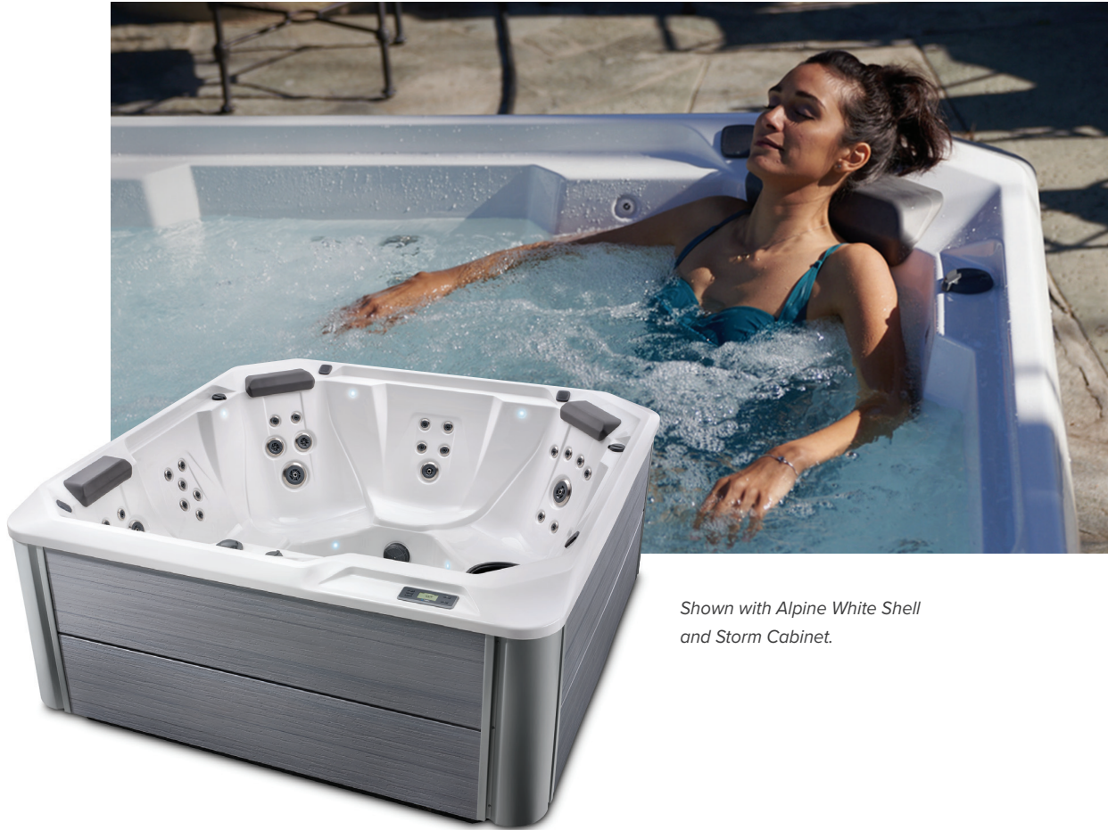
Shown with Alpine White Shell and Storm Cabinet.