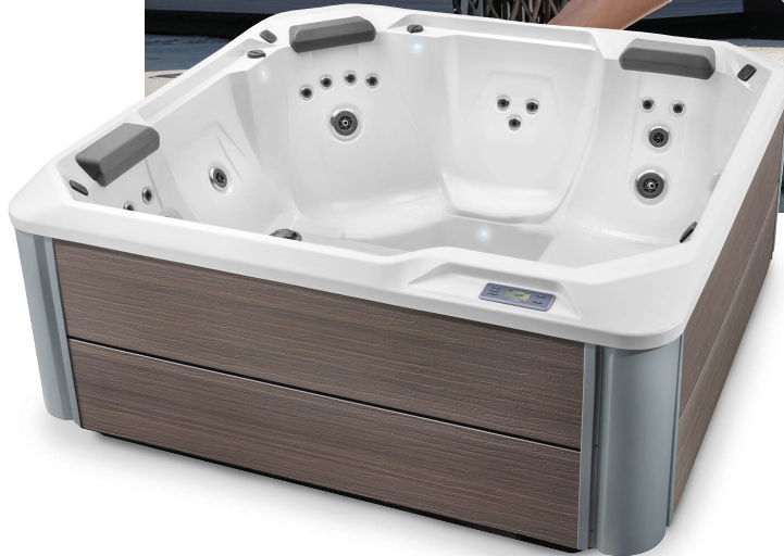
Shown with Alpine White Shell and Havana Cabinet.

People Seating Jets Voltage 5 Seats Lounge 24 Jets 240 V